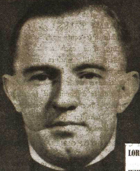
LORD HAW-HAW alias William Joyce